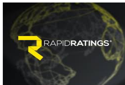
FINANCIAL HEALTH MONITORING FOR SUPPLY CHAIN