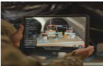
CHEMICAL RECON & CUSTOM OBJECT DETECTION