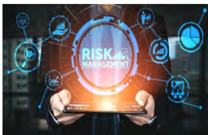
SUPPLIER RISK MANAGEMENT