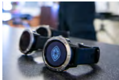
AI GEO-LOCATION & SMARTWATCH HEALTH METRICS